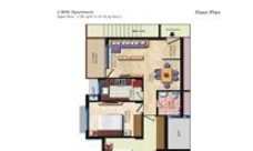
2BHK - 1186 Sq Ft