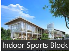
Indoor Sports Block