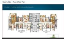
4 BHK - 3870-3124