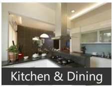
Kitchen & Dining