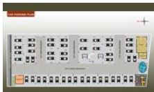
Car Parking Plan