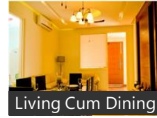
Living Cum Dining