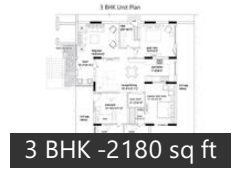
3 BHK -2180 sq ft

* These floor plans are of the project and might not represent the property