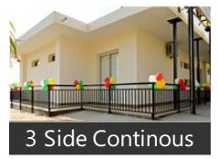
3 Side Continuous