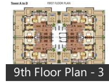
9th Floor Plan - 3