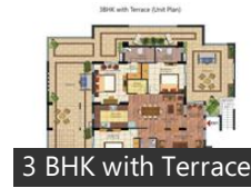
3 BHK with Terrace