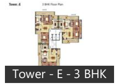
Tower - E - 3 BHK