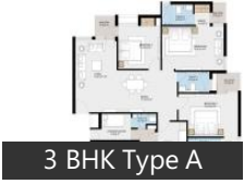
3 BHK Type A