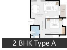
2 BHK Type A