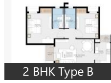
2 BHK Type B