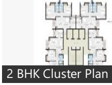
2 BHK Cluster Plan