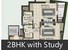
2BHK with Study