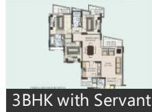
3BHK with Servant