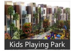
Kids Playing Park