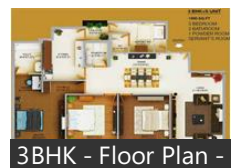
3BHK - Floor Plan -