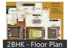
2BHK - Floor Plan