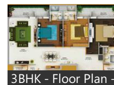
3BHK - Floor Plan -