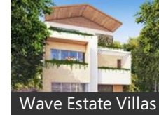
Wave Estate Villas