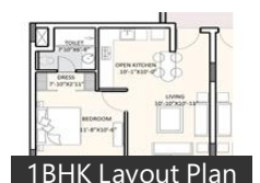
1BHK Layout Plan

* These floor plans are of the project and might not