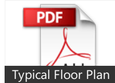
Typical Floor Plan