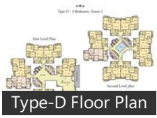
Type-D Floor Plan