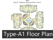
Type-A1 Floor Plan