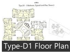
Type-D1 Floor Plan