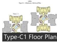
Type-C1 Floor Plan