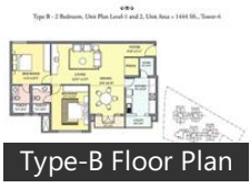
Type-B Floor Plan