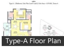
Type-A Floor Plan