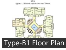
Type-B1 Floor Plan