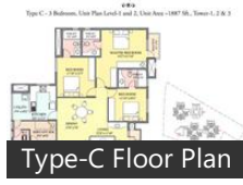
Type-C Floor Plan