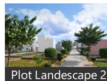
Plot Landscape 2