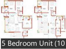
5 Bedroom Unit (10)