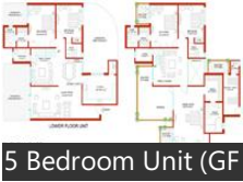
5 Bedroom Unit (GF)