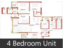
4 Bedroom Unit

Gurgaon Railway Station (<15km), HUDA City Cente (<12km), Crowne Plaza Gurgaon (<12km), Patli Railway Station (<23km), Garhi Harsaru Junction Railway Statio.. IFFCO Chowk (<14km), Road Spiders (<8km), Sai Taxi (<11km), Balaji Tempo Stand (<7km), Global Travels (<11km), TAXI (<13km), Divya Taxi Service (<10km), Rajshree Travels (<10km), Auto Stand (<10km), Tempo Traveller Gurgaon (<11km), Indira Gandhi International Airport (<.. CD Chowk 1 Bus Stop (<3km), SARTHAK TRAVELS (<7km),