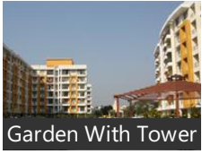
Garden With Tower