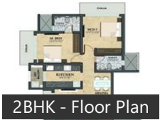
2BHK - Floor Plan