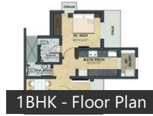
1BHK - Floor Plan