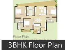
3BHK Floor Plan