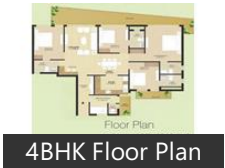
4BHK Floor Plan