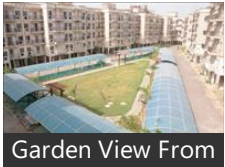
Garden View From