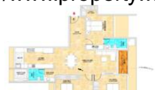
Floor Plan G