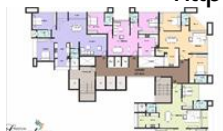
Floor Plan F