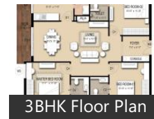
* These floor plans are of the project and might not represent the property