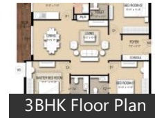
3BHK Floor Plan

* These floor plans are of the project and might not represent the property