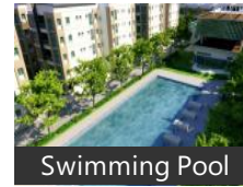
* These pictures are of the project and might not represent the property

Sahoo Variety Store (<2km), Kalinga Nagar Vegetable Market (<3k.. Daily Needs Variety Store (<3km), Sai Kripa Shringar G-20 (<3km), Udyan Fresh (<3km), Easybuy (<3km), Gini & Jony (<3km), Go Colors (<3km), Aurelia (<3km), Mufti (<3km), Twills (<3km), U. S. Polo Assn. (<3km), Louis Philippe (<3km), PETER ENGLAND (<3km), VAN HEUSEN (<3km), Manyavar (<3km), Lenskart. Com (<3km), Splash (<3km), Crimsoune Club (<3km), Dulhan Bridal Exclusive Store (<3km), Spykar (<3km), Zudio (<3km), Reliance Trends (<3km), Fbb (<3km), Sketchers (<3km), Skechers (<3km), Being Human (<3km), Hoffmen (<3km), Sin Denim (<3km), Monte Carlo (<3km), Span (<3km)