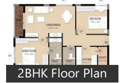
2BHK Floor Plan