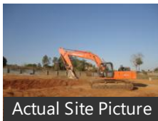
Actual Site Picture