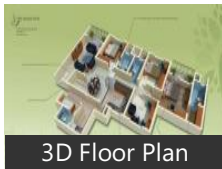
3D Floor Plan