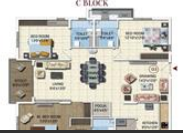
Floor Plan E

* These floor plans are of the project and might not represent the property