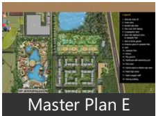
Master Plan E