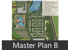
Master Plan B