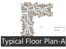
Typical Floor Plan-A