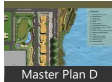
Master Plan D