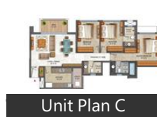
Unit Plan C