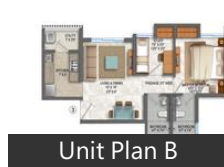
Unit Plan B