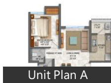
Unit Plan A