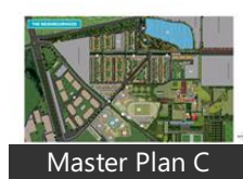
Master Plan C