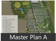
Master Plan A