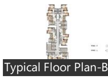
Typical Floor Plan-B