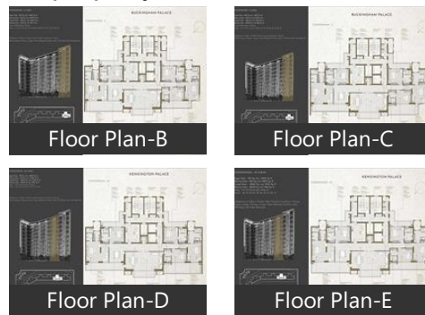
* These floor plans are of the project and might not represent the property