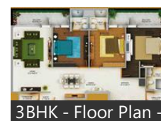
3BHK - Floor Plan -