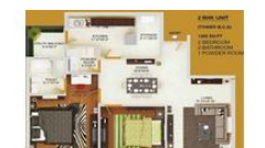
2BHK - Floor Plan