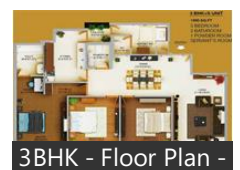
3BHK - Floor Plan -