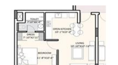
1BHK Layout Plan

* These floor plans are of the project and might not