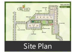
* These floor plans are of the project and might not represent the property