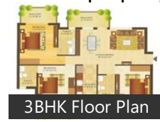
3BHK Floor Plan