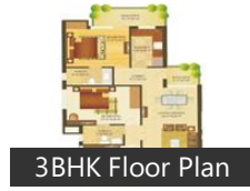
3BHK Floor Plan