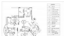
Floor Plan F