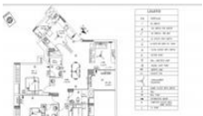
Floor Plan E