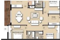
3BHK Floor Plan

* These floor plans are of the project and might not represent the property