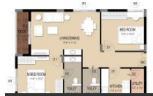
2BHK Floor Plan