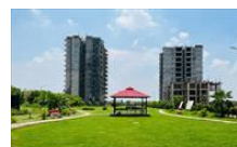
Leela Orchid Greens