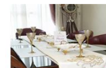
Leela Orchid Greens