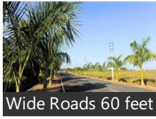
Wide Roads 60 feet