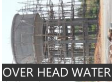
OVER HEAD WATER