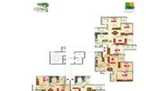
Floor Plan J