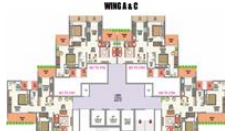
Floor Plan H