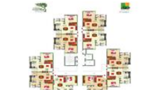
Floor Plan I