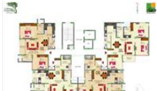
Floor Plan G