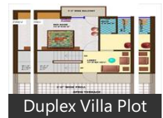
Duplex Villa Plot

* These floor plans are of the project and might not represent the property