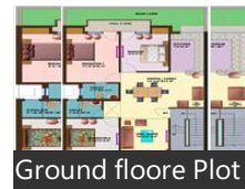
Ground floor Plot -