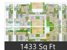
1433 Sq Ft