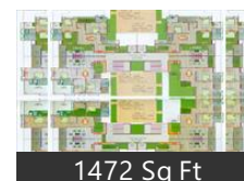
1472 Sq Ft