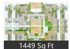
1449 Sq Ft