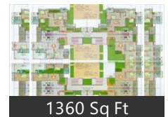
1360 Sq Ft