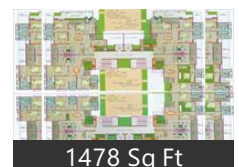
1478 Sq Ft

* These floor plans are of the project and might not represent the property