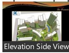
Elevation Side View