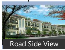
Road Side View