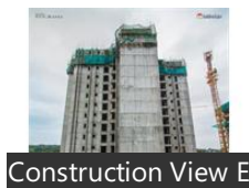
Construction View E