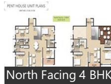
North Facing 4 BHK