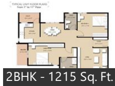
2BHK - 1215 Sq. Ft.