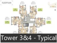
Tower 3&4 - Typical