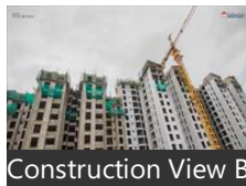
Construction View B