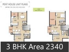
3 BHK Area 2340 Sq. Ft.