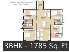
3BHK - 1785 Sq. Ft.