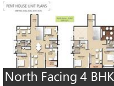
North Facing 4 BHK