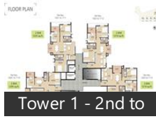
Tower 1 - 2nd to 5th