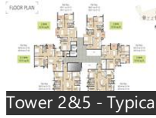
Tower 2&5 - Typical