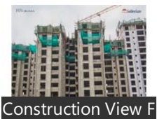
Construction View F