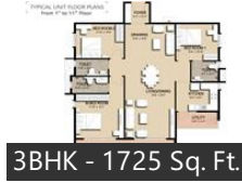
3BHK - 1725 Sq. Ft.