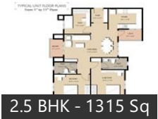
2.5 BHK - 1315 Sq. Ft.