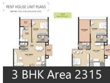
3 BHK Area 2315 Sq. Ft.