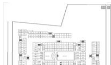
Bada Bazaar- typical