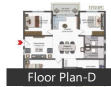
Floor Plan-D * These floor plans are of the project and might not represent the property

Shri Sai Venkateshwara Hosiery (<0.5... Jockey (<0.5km), Boys Zone (<0.5km), Balaji Rampal Kirana & General Store... Devi Kirana General Stores (<0.5km), Sri Maruti Kirana & General Stores (<... Thirumala Matchings (<0.5km), Gurudatta Kirana & General Store (<0. Bata (<0.5km), Rice Depot (<0.5km), Prakash Kiranam (<0.5km), Lucky Hosiery (<0.5km), Provision (<0.5km), Fresh Miyapur (<0.5km), Vogue Aware (<0.5km), Heritage Fresh (<0.5km), Parameswar Provision Kirana & Gene.. Vaishno Designers & Collections (<0... Mahalakshmi Kirana General Stores (... Sneha Fancy Kirana & General Store ... Fabric Fashions (<0.5km), Venkata Sai Saree House & Matching.. Suresh Kirana General Stores (<0.5km.. Balaji Kirana & General Stores (<0.5k... Sai Naveen Footwear (<0.5km), Pooja Fashions (<0.5km), Brand. Com (<0.5km), Shri Kala Designing Studio (<0.5km), Sneha Fancy (<0.5km), Iconic Fashion (<0.5km), Shri Ganesh Grand Bazaar (<0.5km), S. R. Ladies Apparels (<0.5km), Laxmi Bangles & General Stores (<0.5.. Mna Company (<0.5km), Northex Fashion (<0.5km), LACOSTE (<0.5km), Nandi Hosiery (<0.5km), Mallika Foot Wear (<0.5km), Jai Hanuman Kiranam & General Sto... Lakshmi Foot Wear (<0.5km), Sai Lakshmi Silks (<0.5km), Ganesh Traders (<0.5km), Mega Mart (<0.5km), NMN Collections Sarees & Matching.. Free Style (<0.5km), New Welcome Kirana & General Stor... Bharathi Kirana & General Store (<0.5.. Mataji Provision Store (<0.5km)