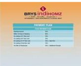
Payment Plan B