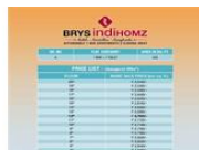
Price List A