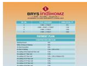
Payment Plan A