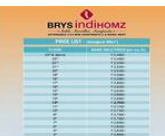
Price List B