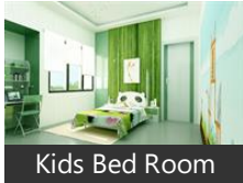
Kids Bed Room