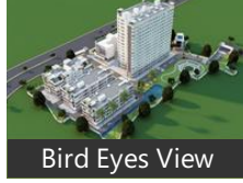
Bird Eyes View