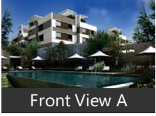
Front View A