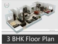
3 BHK Floor Plan