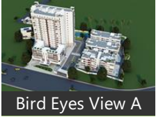
Bird Eyes View A