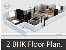
2 BHK Floor Plan.