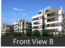
Front View B