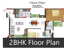
2BHK Floor Plan