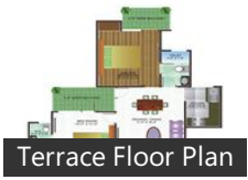
Terrace Floor Plan