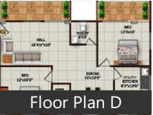
Floor Plan D