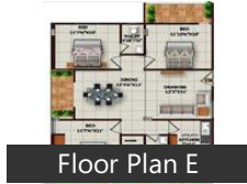
Floor Plan E