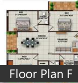
Floor Plan F