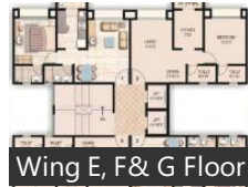
Wing E, F& G Floor