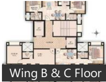
Wing B & C Floor