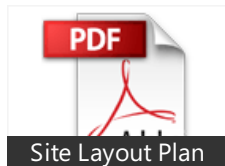
Site Layout Plan