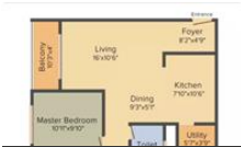
Floor Plan F