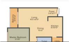
Floor Plan E