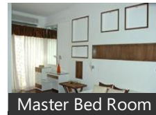
Master Bed Room