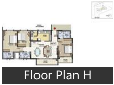
Floor Plan H