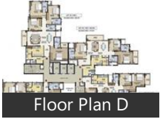
Floor Plan D