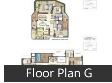
Floor Plan G