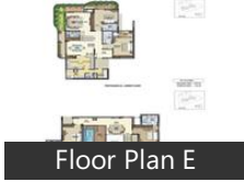
Floor Plan E