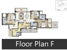
Floor Plan F