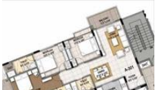
Floor Plan H