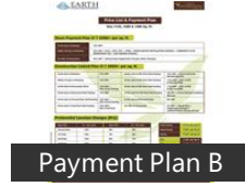
Payment Plan B