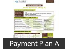
Payment Plan A