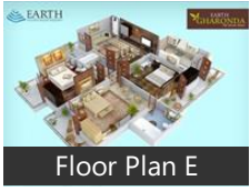
Floor Plan E