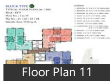
Floor Plan 11