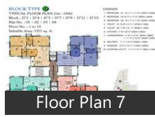
Floor Plan 7