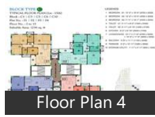
Floor Plan 4