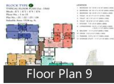
Floor Plan 9