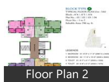
Floor Plan 2