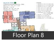
Floor Plan 8