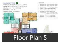
Floor Plan 5