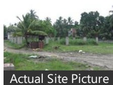
Actual Site Picture