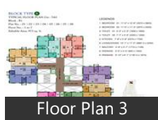
Floor Plan 3