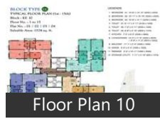
Floor Plan 10