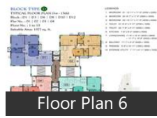
Floor Plan 6