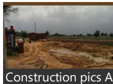
Construction pics A