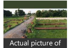
Actual picture of