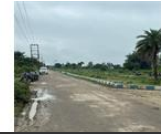
Actual picture of