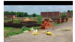
Actual picture of