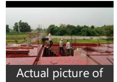
Actual picture of