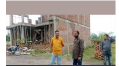
Actual picture of