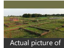
Actual picture of