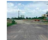
Actual picture of